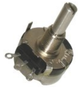
Representative photograph, actual product appearance may vary.

Due to regional agency approval requirements, some products may not be available in your area. Please contact your regional Honeywell office regarding your product of choice.